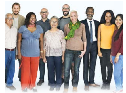
THE TOP SEVEN CANCER SITES WE TREAT

In 2017, St. Peter's Hospital Cancer Care Center continued to provide care for a large volume of new cancer patients. In total, we diagnosed and/or treated 3,363 new cancer patients. The top seven cancer sites we treated were breast, lung, uterus, prostate, colon, bladder, and pancreas.