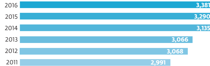
Number of new patient cases per year