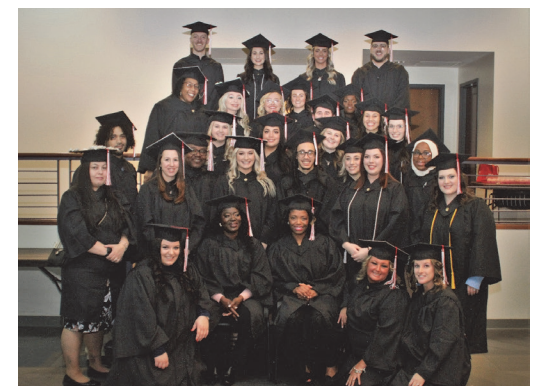
December Graduates 2022