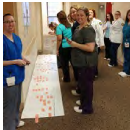
Current Nursing IV Students

Plan to join us at the May 9th Dinner Meeting!