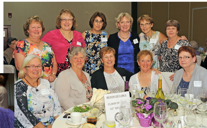
Members of the Class of 1975 celebrate their 40 th reunion at this year's event.