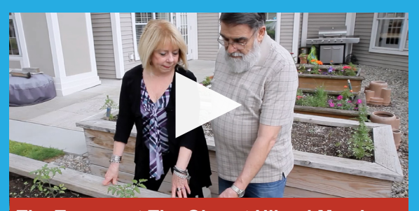
The Terrace at The Glen at Hiland Meadows